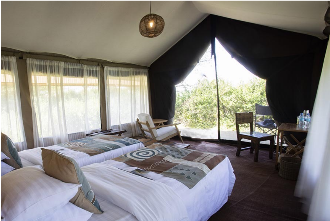
Nyikani Southern Camp