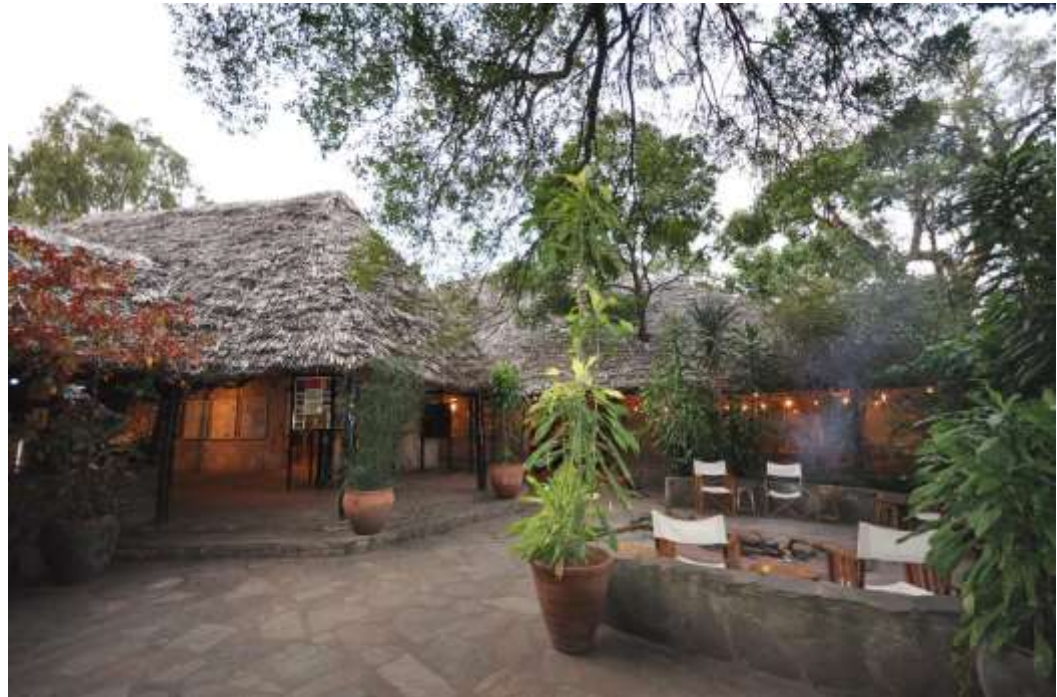
Fig Tree - Mara