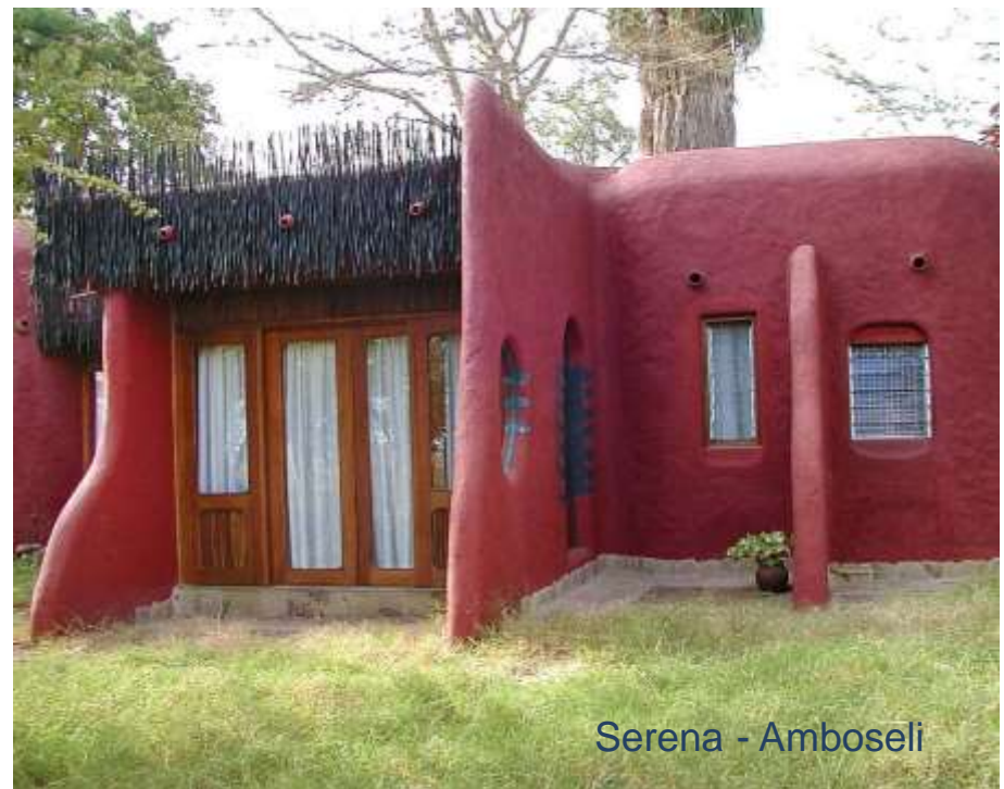
Serena - Amboseli