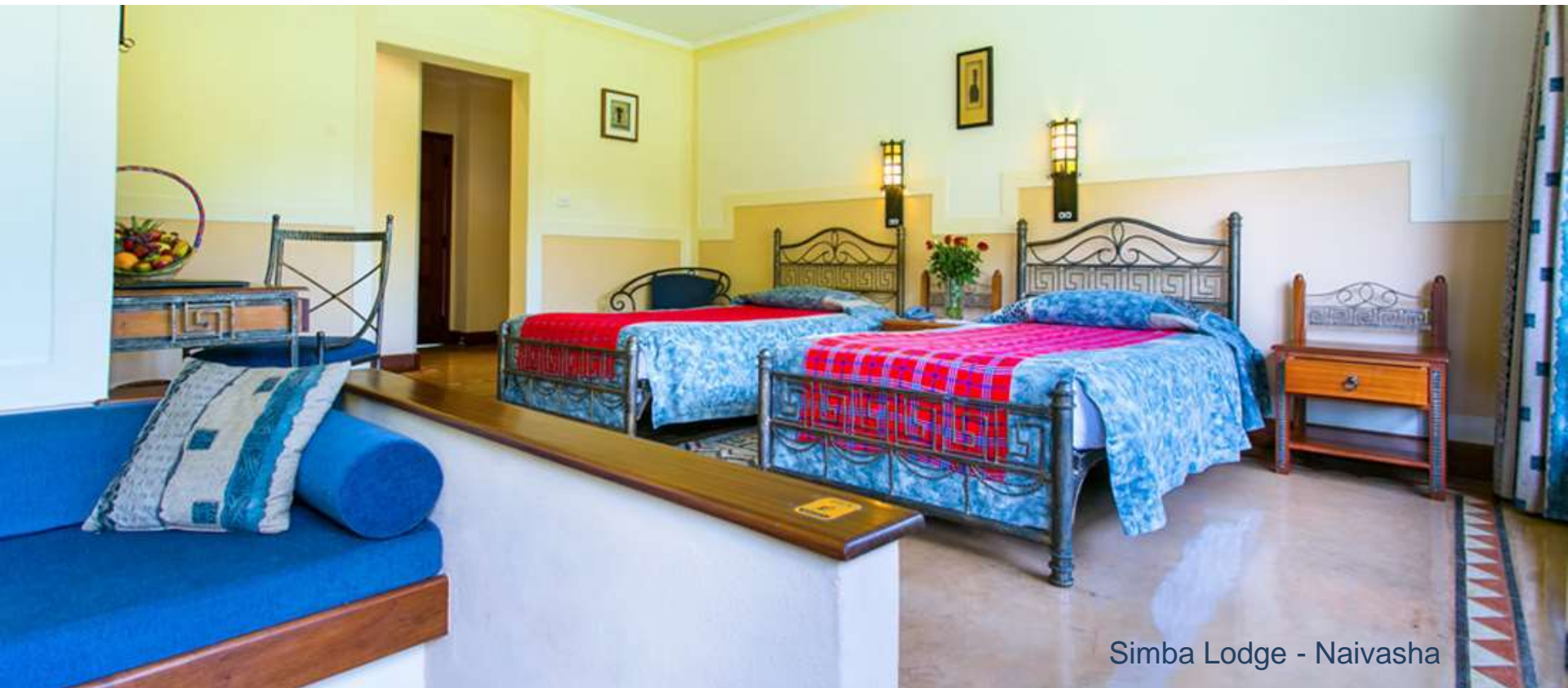
Simba Lodge - Naivasha