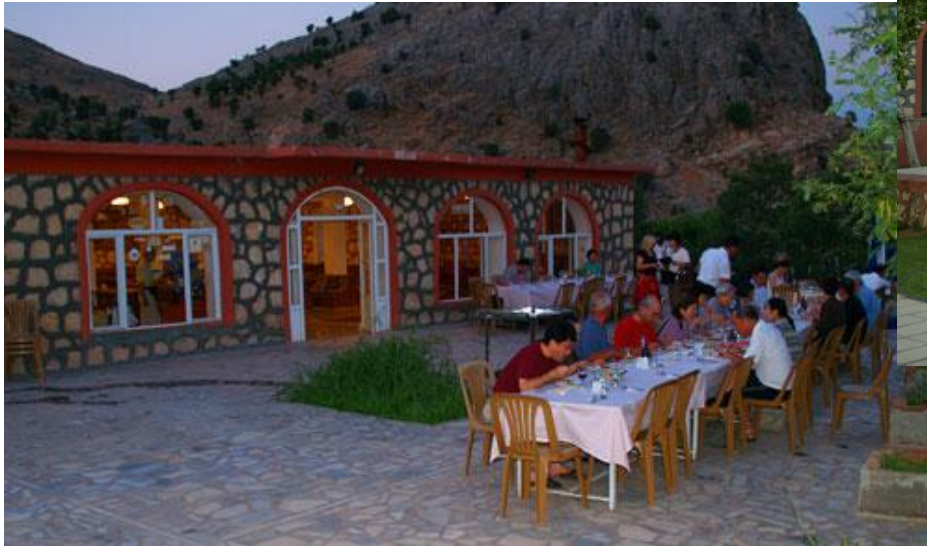
Euphrat Hotel - Kahta