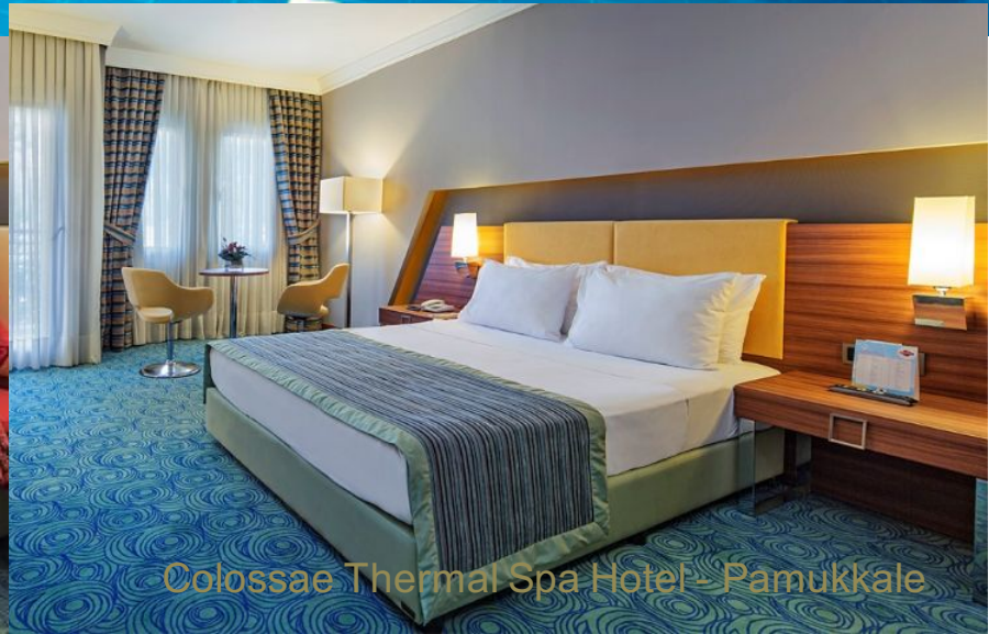
Colossae Thermal Spa Hotel - Pamukkale