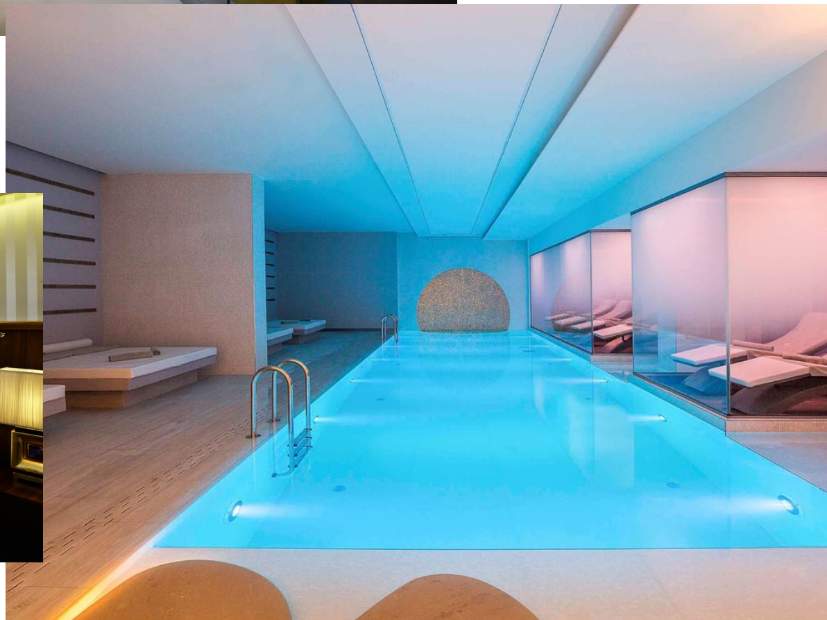
Novotel Bosphorus - Istanbul