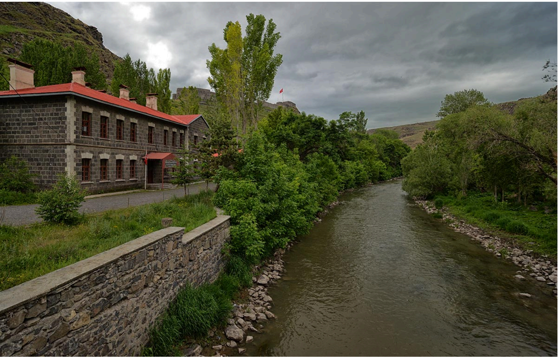
Katerina Palace Hotel - Kars