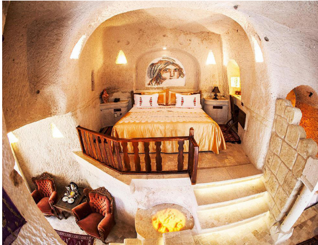
Gamirasu Cave Hotel - Cappadocia

After a late breakfast & lunch along the way, we head to the airport at Adiyaman for our flight to Kayseri via Istanbul. After arriving in Kayseri we drive to Cappadocia to our gorgeous Gamirasu Cave Hotel. Dinner & overnight.