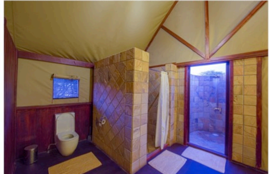
Lake Ndotu luxury tented Lodge