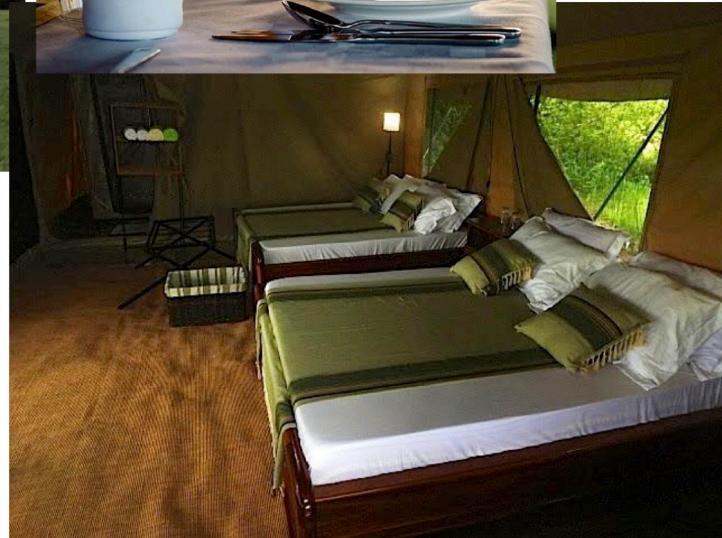
Mbugani tented Seronera Camp